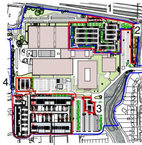
Key Plan Sheet 2 1 : 5000